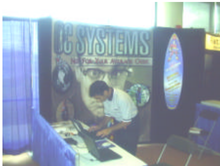
OC System's Booth