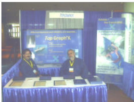
Top Graph X's Booth