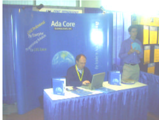
Ada Core Technologies (ACT's) Booth