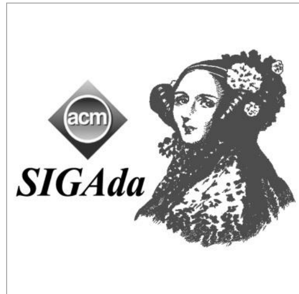
IMAGE: THE ACM SPECIAL INTEREST GROUP ON ADA (SIGADA). view more >